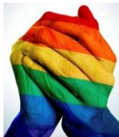
(Visit our moving prayers page Right Click Here. )

Brother: PRAYERS FOR THE PEOPLE: Family of President Carter, victims of all the fires in California, the children who have experienced trauma, the elderly who were forced from their nursing centers, the family members who still are uncertain if their loved ones are safe, Hurricanes, floods, war, disease, and healing; who else should we pray for?